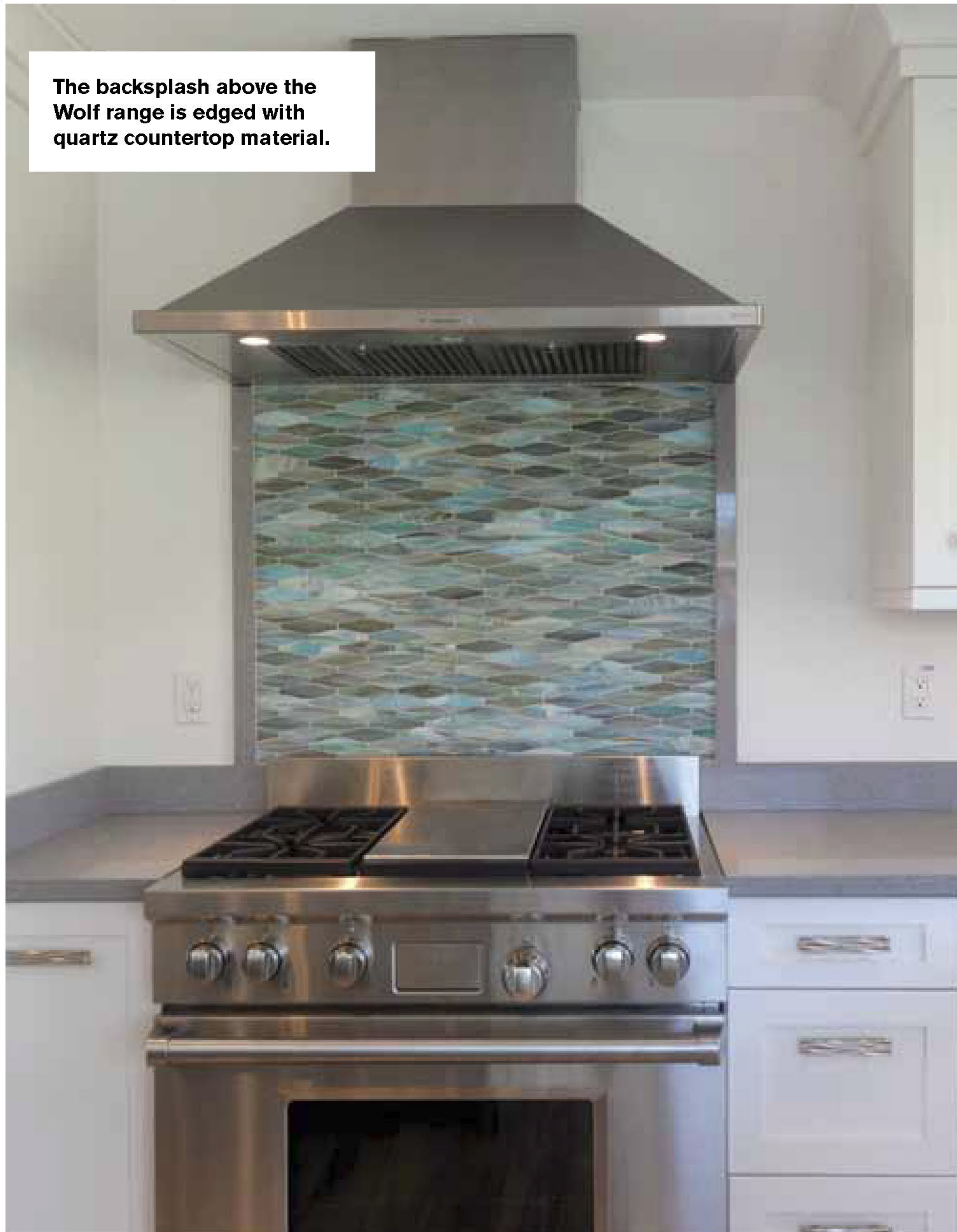
The backsplash above the Wolf range is edged with quartz countertop material.