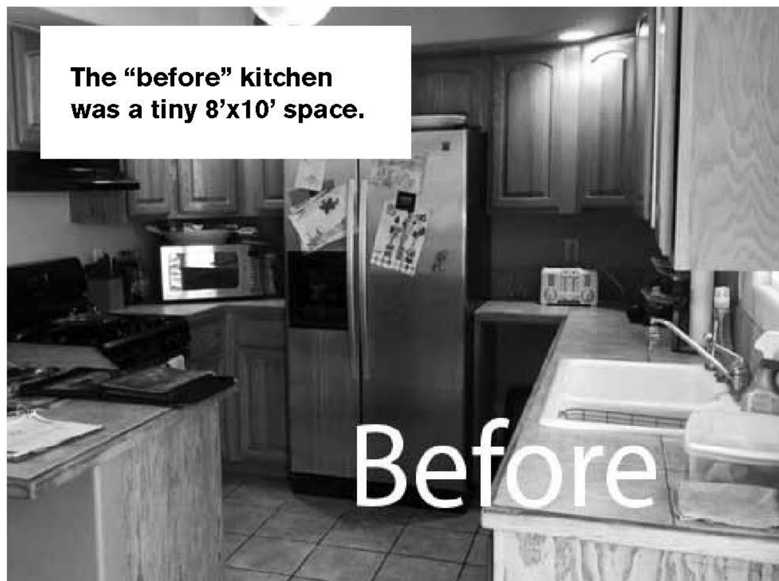
The “before” kitchen was a tiny 8’x10’ space.

with Siren Sportfishing. This spring, they will acquire a new double-deck 46-foot Newton dive boat. Greg captains a 34-foot Black Watch Sportfisher.